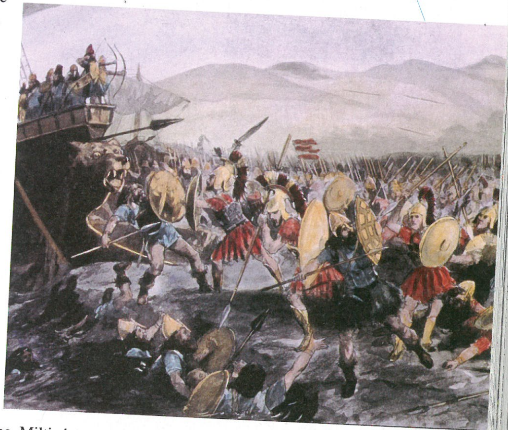
The Battle of Marathon was the first of many battles between the Greeks and Persians.