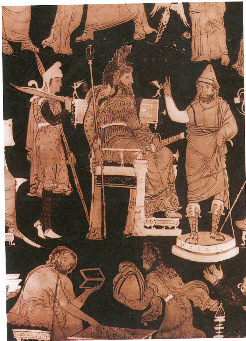
King Darius of Persia holding a council of war.

The Ionians knew they could not defeat the Persians by themselves, so they asked mainland