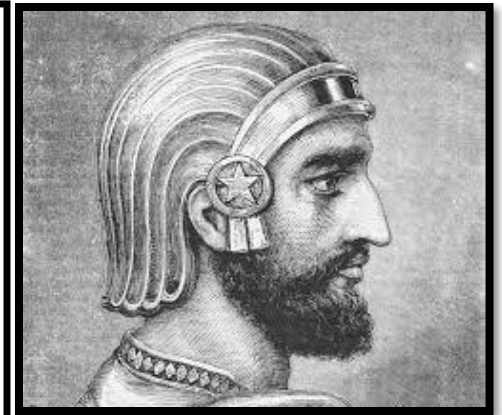
Cyrus The Great